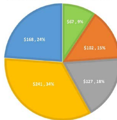
OTHER SOURCES OF FUNDING (000) APRIL 1, 2017 - MARCH 31, 2018

■ Gaming ■ Individuals, memoriums, legacies ■ Corporations ■ Foundations ■ Events, net